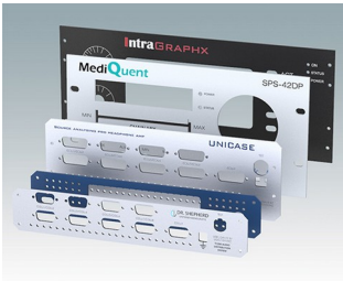
M0000410 Custom Front Panel Aluminium

Subject to technical modification without notice. © OKW Enclosures Ltd